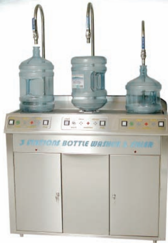
Dimensions: 46 1/4" (117.48cm) w x 37 5/8" (95.57cm) h x 23" (58.42cm) d Weight: 175lbs (79.38kg)

Attractively positioned in a water store, The BWF-3 allows a bottled water customer to safely and hygienically clean their own bulk bottles through a four step automated wash, rinse, sanitize and final rinse cleaning process. Following sterilization, the bottle can be easily positioned for pure water filling and taken home for enjoyment.